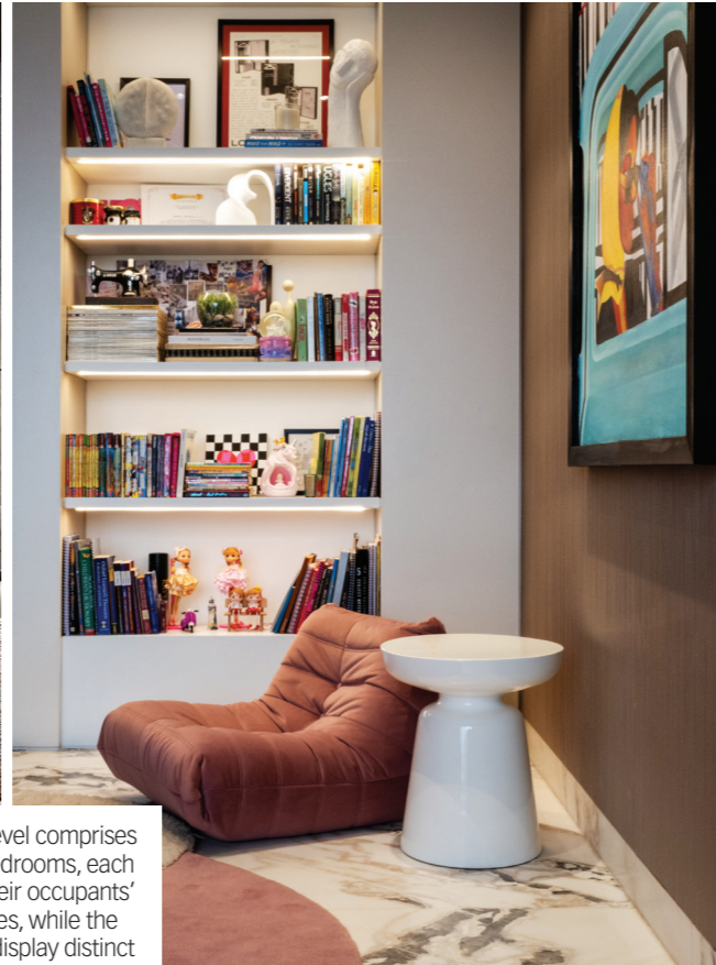
The upper level comprises individual bedrooms, each exhibiting their occupants' personalities, while the bathrooms display distinct designs, with one featuring a blend of terrazzo and metal with pastel pinks and another adopting darker tones for a luxurious modern aesthetic.