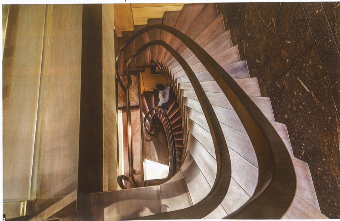
2. TPA's practice is driven by a simple philosophy: to make clean, elegant, detail-oriented and timeless structures.

During that time, he never stopped learning, taking inspiration from various iconic structures along the way. Whether it was the Victoria Terminus' ability to serve people on a daily basis, which made him realise very early on that architecture has the power to influence the lives of millions, or the Seagram Building in New York City and the John Hancock Tower in Boston for their perennially classic appeal that set the standard for the modern skyscraper; he took it all